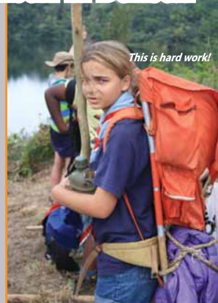
This is hard work!